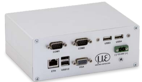
thermoIMAGER TIM NetPCQ