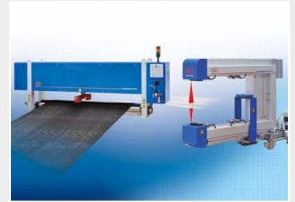
Measuring and inspection systems for metal strips, plastics and rubber