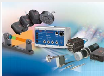
Color recognition sensors, LED analyzers and inline color spectrometers