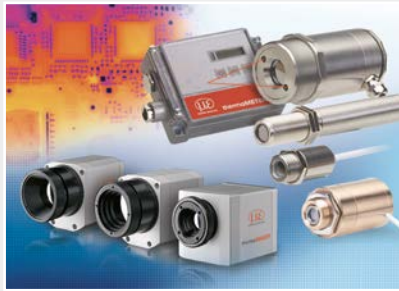
Sensors and measurement devices for non-contact temperature measurement