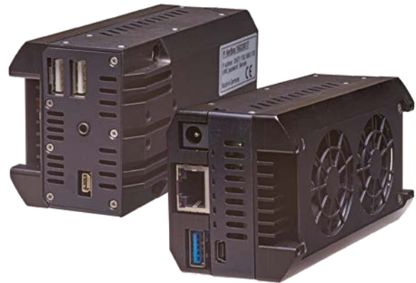
thermoIMAGER TIM NetBox