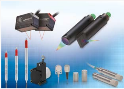
Sensors and systems for displacement, distance and position