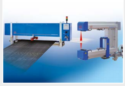
Measuring and inspection systems for metal strips, plastics and rubber