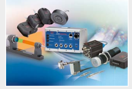
Color recognition sensors, LED analyzers and inline color spectrometers