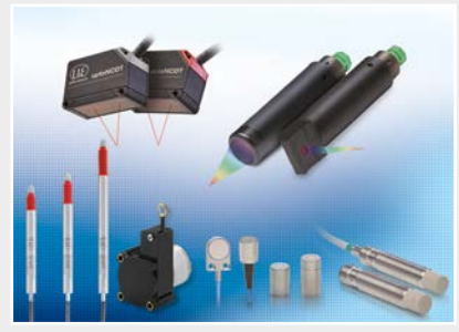
Sensors and systems for displacement, distance and position